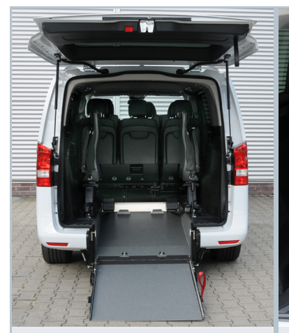
With the unfolded ramp the vehicle can be accessed comfortably with a wheelchair.

Mercedes-Benz eVito Long (L2) / Extra Long (L3)